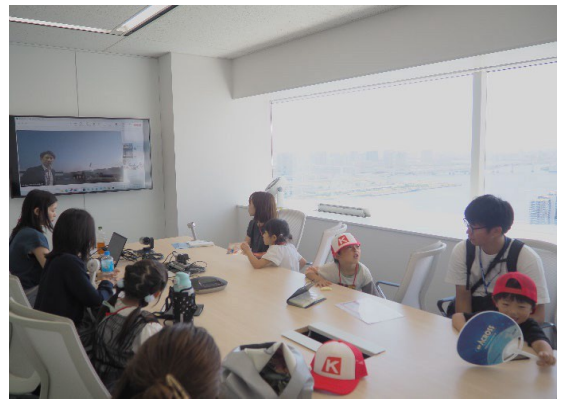
Web conference with the Los Angeles branch!