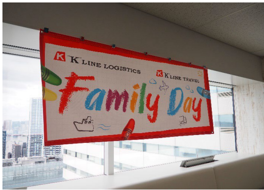
The banner for Family Day!