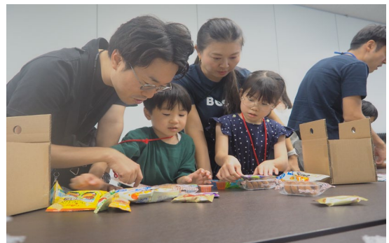
Dad taught me a lot of things!