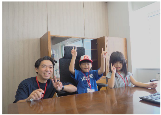
Commemorative photo at the chairman's seat