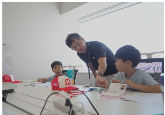
Making own passport...