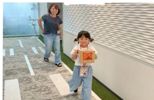
Delivering candies to foreign countries!