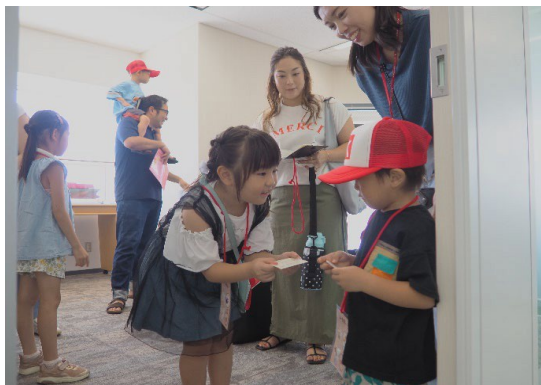
Exchanging business cards with another kids